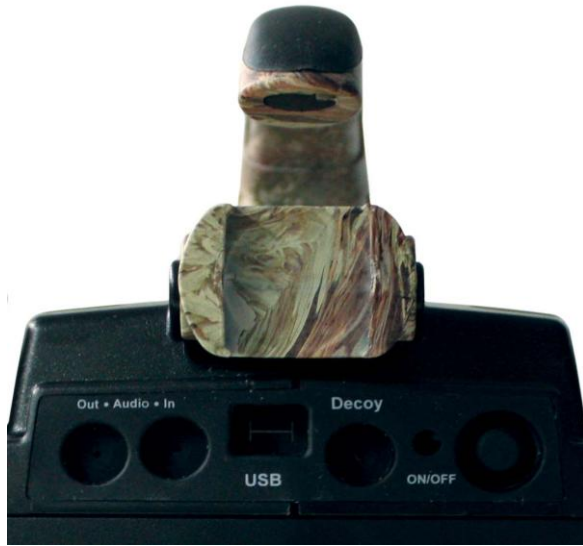
ALPHA DOGG SPEAKER - BACK