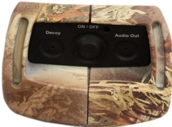
TURBO DOGG SPEAKER - BACK

AUDIO OUT – Add external speaker (not included) for additional sound volume. External speaker rating must be 25watts or greater.